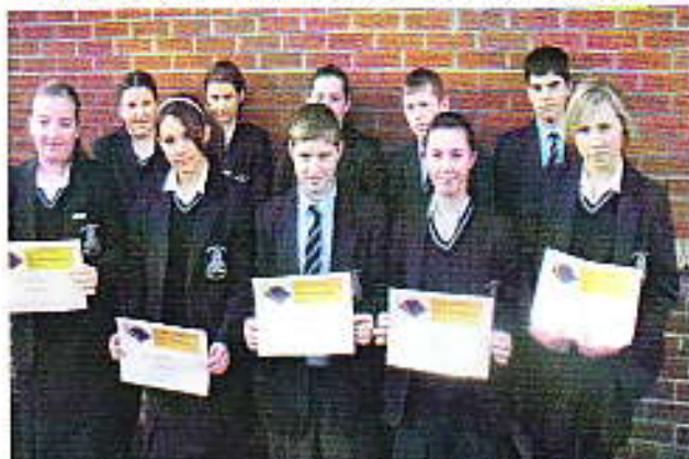
Year 10 pupils receiving their Pupil of the Month Certificates for October.